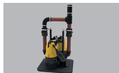
Pumps are not included in the scope of delivery