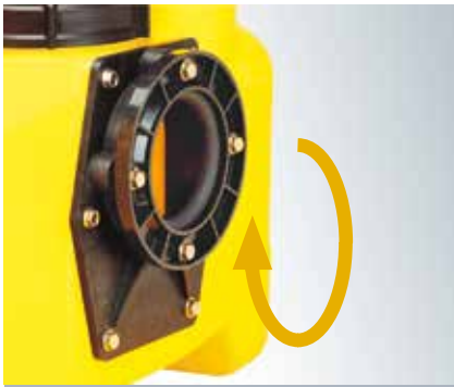
Height adjustable clamping flange complli 400