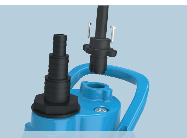
Replaceable cable for problem-free cable exchange