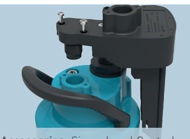
Accessories: Simer Level Control easy to insert in the pump