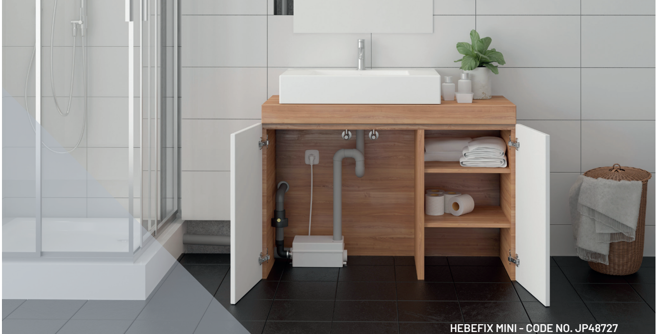
HEBEFIX MINI - CODE NO. JP48727